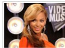
PHOTOS: Beyonce Flaunts Baby Bump On VMA Red...