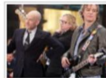
R.E.M. Breaks Up